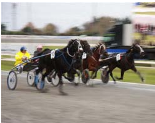
I CAN DOOSIT & THE BRECKONS