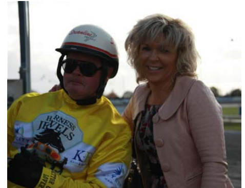
BETTOR COVER LOVER & TEAM