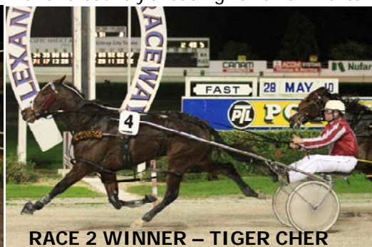
RACE 2 WINNER – TIGER CHER