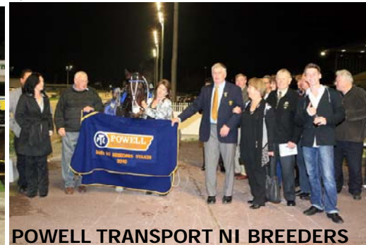
POWELL TRANSPORT NI BREEDERS